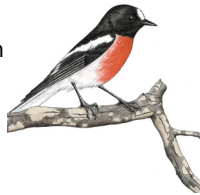
Scarlet Robin (male)

Drive about 3km south from the main bridge over the Blackwood River, then turn right into Rifle Range Rd. Drive 500m and turn right along a track (turnoff marked '50') and park in a small clearing. Explore several creekline tracks through dense vegetation for Red-eared Firetail and Red-winged Fairy-wren. Options to walk or drive 1km further along the main track to a T junction, turn left and back through old growth forest to Rifle Range Rd, with many birding spots along the way. Masked Owl, Tawny Frogmouth and Red-tailed Black-Cockatoo can be found here.