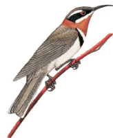
Western Spinebill (male)

Enjoy a scenic drive along Brockman Highway for about 20km to Bridgetown Jarrah Park. Turn right at the sign and drive along a short track to the secluded picnic area with toilets. The four loop walks (0.8-5.9km) meander along Maranup Brook and take you through differing habitats with four of the main tree species present (Karri, Jarrah, Marri and Blackbutt) and an abundance of wildflowers in spring.