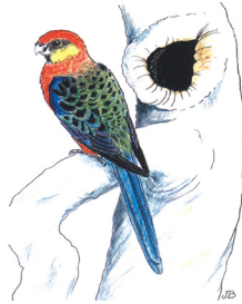
Western Rosella (male)

An easy 3-4km return walk along the Blackwood River with seating to enjoy the quiet ambience and birdlife. Start at the car park at the River Park next to the main bridge and follow the boardwalk across the river. Turn left for a shorter walk to a creekline or right to walk to Gifford Rd and back among Marri and Jarrah trees and views to the river with Melaleuca thickets. Look for waterbirds along the river: Purple Swamphen, Eurasian Coot, Australasian and Hoary-headed Grebes and cormorants. Along the track, Western Rosella, Red-capped and Elegant Parrots, Golden Whistler, Red-eared Firetail, Red-winged and Splendid Fairy-wrens, Fan-tailed Cuckoo, Striated Pardalote and sometimes Crested Shrike-tit can be found.