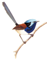
Red-winged Fairy-wren (male)

Drive into Greenbushes and turn into Spring Gully Rd off Blackwood Rd and Telluride St, then drive or walk about 1km to the Greenbushes Pool. An attractive pool and wetland setting with boardwalk, picnic tables, BBQ and toilets. A variety of birds are found here including White-breasted Robin, Red-winged Fairy-wren, Western Spinebill and Red-eared Firetail. Various walking and driving tracks from the pool join the Greenbushes Loop Walk to Dumpling Gully and the Bibbulmun Track taking you through different habitats, including sheoak woodland with prospects of finding Western Yellow Robin and White-browed Babbler.