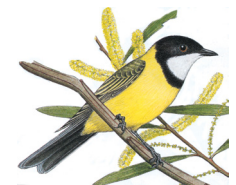
Golden Whistler (male)

Old growth trees, fallen logs, banksias, tall shrubs and moist creekline habitats attract a variety of birds including Red-winged Fairy-wren, Spotted Pardalote, White-breasted and Yellow Robins, White-browed Scrubwren, Western Rosella, Crested Shrike-tit, Red-tailed Black-Cockatoo, Western and Red Wattlebirds, Western Gerygone and Varied Sittella.